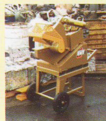
200 8" shear